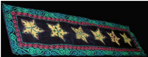
Table Runner 120x30cm